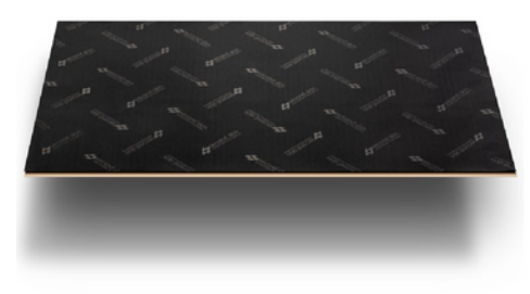
Damplifier Pro's subtle ghosted logo won't turn your vehicle into a billboard