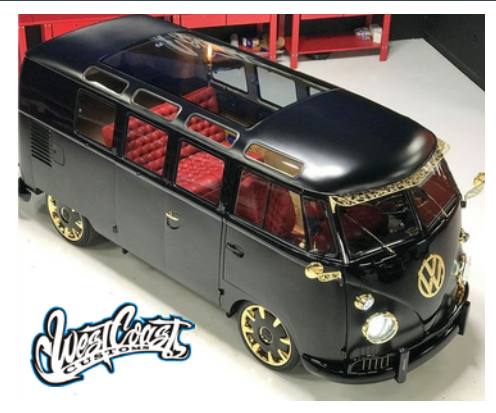
Steampunk VW Bus - West Coast Customs has been using Damplifier Pro since the Pimp My Ride days